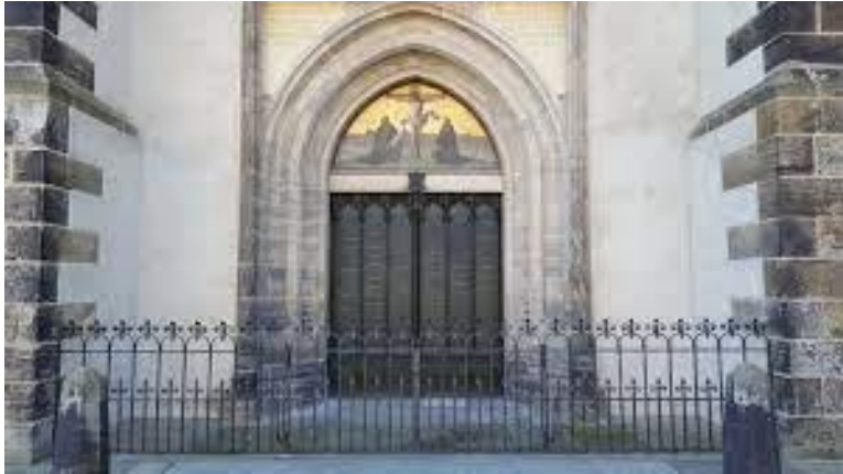
Castle Church doors, Wittenberg

6:30-10:00: Breakfast: Kempinski-Depart for various locations