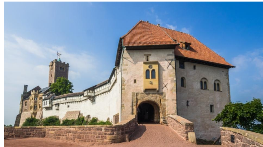
The Wartburg Castel, Eisenach

6:30-9:00: Breakfast: Anna A 10:00-10:45: Table Talk: A Truth to Believe in. 10:45-12:00: Depart for the Wartburg Castle 12:00-1:00: Lunch: Wartburg Castle, Landegrassen 1:00-3:30: Tour of Castle 4:00-5:30: Depart for Hotel 6:00-7:30: Dinner: Anna A 7:30: Evening Prayer