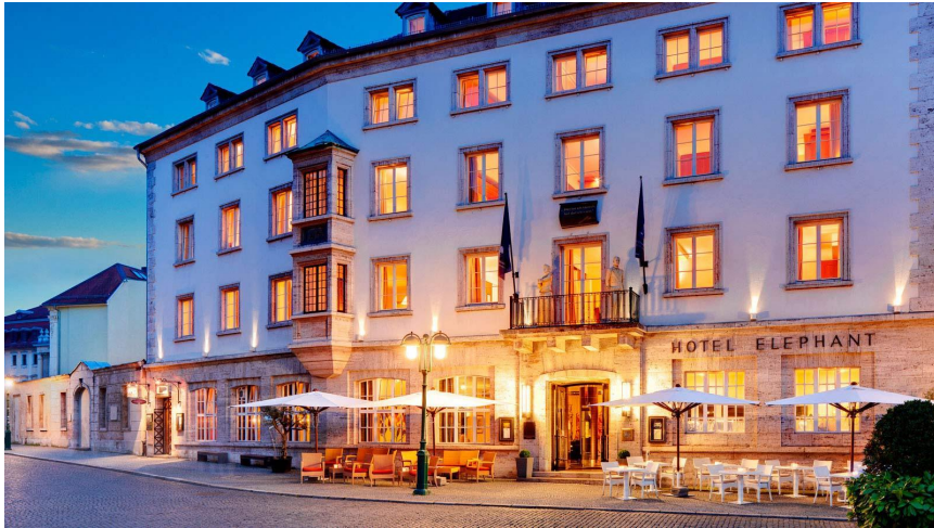
The historic Hotel Elephant, Weimar