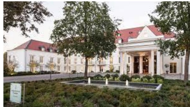
The Kempinski Gravenbruch

6:00: Reception, Dinner and Lecture: Join us at the Kempinski Gravenbruch , 15 minutes from the Frankfurt airport via cab.