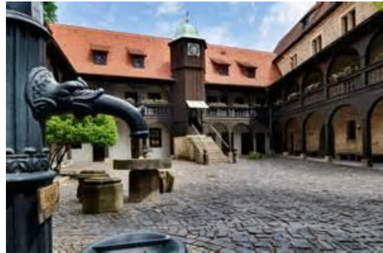
The Black Cloister, Erfurt

6:30-9:00: Breakfast: Anna A 9:00-9:30: Table Talk 9:45-10:15 Stotternheim 10:15-10:45: Table Talk: Lightning Bolts from Heaven 11:15-12:00: Black Cloister, Erfurt 12:00-12:45: Chapter Room 1:00-2:00: Lunch: Augustiner 2:00-3:30: St Mary's Cathedral 5:30: Table Talk: The Family Life of Luther 6:30: Dinner: Anno 1900