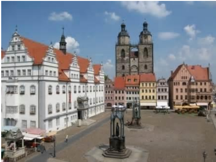
Wittenberg Town Square

6:30-8:30: Breakfast: Anna A 8:30-11:00: Depart: Wittenberg: Luther Stadt 11:00-11:45: Panorama: Medieval Life 12:00-1:30: Lunch: Alte Canzley 1:30-3:30: Wittenberg, Augustinian Monastery 4:00-6:30: Depart Wittenberg 7:00-8:30: Dinner: Anna A