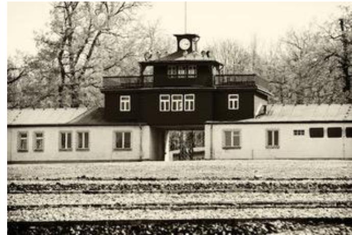
Buchenwald Concentration Camp, Weimar