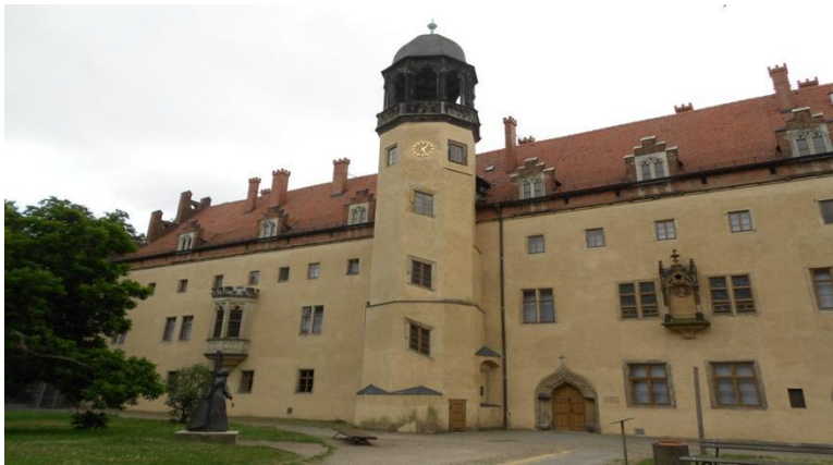
Augustinian Cloister, Wittenberg